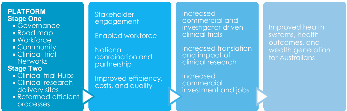
Figure 3: Logic Model for investment in a National Clinical Research Acceleration Platform

Ultimately we will improve health and wellbeing, providing access for Australian children, adolescents, families, adults and the elderly to the best cutting edge treatments, whilst delivering greater prosperity, jobs and wealth for Australia.