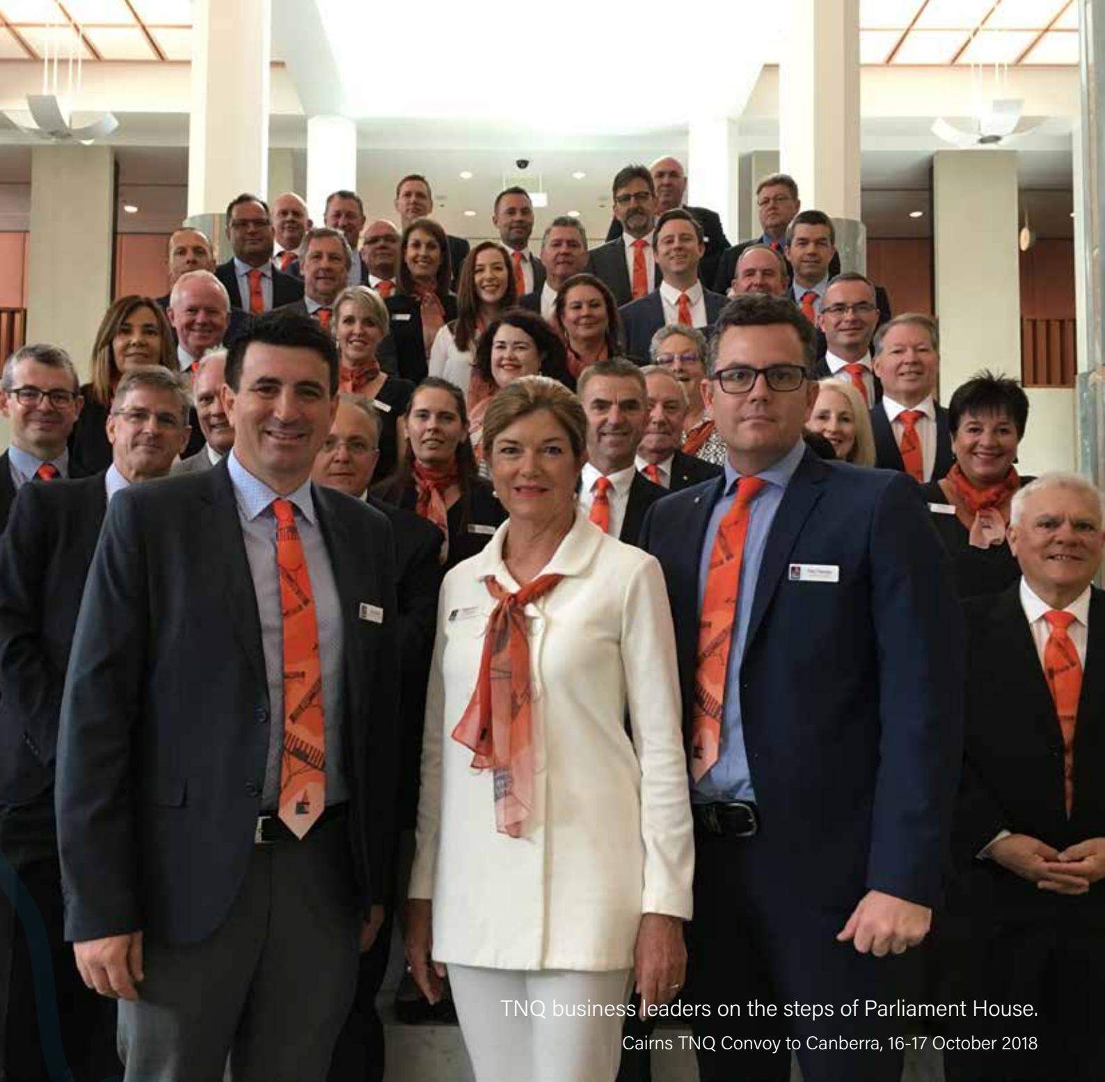
TNQ business leaders on the steps of Parliament House. Cairns TNQ Convoy to Canberra, 16-17 October 2018